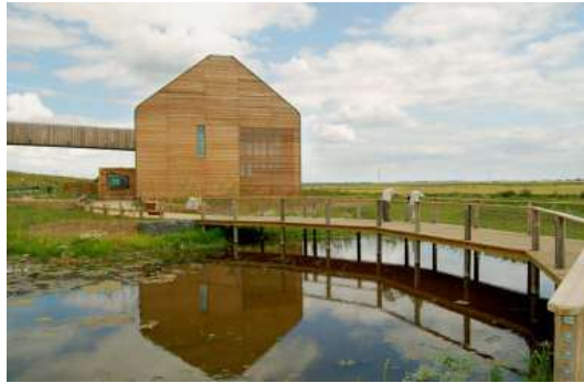
Figure 2.13 Wetlands and Wildfowl Trust (wwt), Welney, England

A new visitor centre for the Wildfowl and Wetlands Trust bird sanctuary was designed around environmental and sustainable elements in keeping with the location and provides an area for visitors including a café, shop, educational facilities, exhibition and community space (Figure 2.13). Rainwater is collected from the building roof, combined with SUDS drainage in the car park allowing surface water run off from the site to be used to create ponds and a wetland habitat. Wastewater from the building is treated in a reed bed system to allow outfall into an adjacent water course (Ove Arup, 2007).