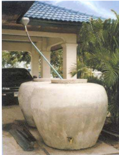
Figure 2.10 Water storage jar, Khon Kaen, Thailand

for less than $30 per jar, thus enabling the purchase of the jars throughout the population. www.ircsa.org/factsheets/lowincome.htm