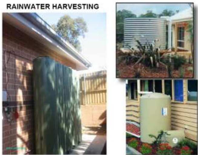
Figure 2.5 Water storage tanks, Australia