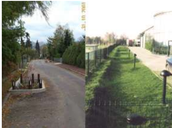
Figure 2.8 Stormwater infiltration systems, Germany

Stormwater infiltration is obligatory for new developments by law in most Federal states (Figure 2.8). 60% of the drinking water in Germany is taken from groundwater and 100% in Berlin. Aquifers are a cheap cistern and it is more efficient to renew groundwater resources than to collect rainwater in man-made tanks. Property owners can save the stormwater fee by infiltrating rainwater.