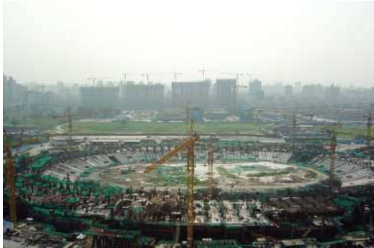
Figure 2.7 Beijing National Stadium, China

stadium. This system will significantly lessen the burden on decreasing water resources in Beijing City, while it will embody the Spirit of the Beijing Olympics, thus combining social and economic benefits (Ove Arup, 2007).