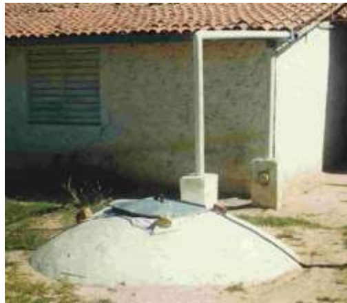
Figure 2.6 Water storage tank, Petrolina, Brazil

Petrolina is in the semi-arid belt of north east Brazil. Rainfall is low and varies from year to year. Tanks with 1-2 kl capacity are used to store water for each household (Figure 2.6). They are usually provided by NGOs as the cost, starting from $200 per tank, is unaffordable by the local population. www.ircsa.org/factsheets/lowincome.htm