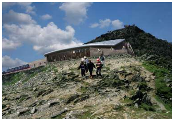
Figure 2.12 Snowdon Summit Building, Wales

This project is a redevelopment of the cafe/visitors centre at the summit of Mount Snowdon in north Wales (Figure 2.12). The building is the highest in England and Wales and its remote location provides a unique challenge to the design team as there are no mains services to the site. Electricity will be generated on site via a combined heat and power unit from which waste heat will provide heating and hot water to the building. Rainwater will be stored and reused for non-potable use to limit the amount of water which has to be carried up on the already over-stretched mountain railway (Ove Arup, 2007).