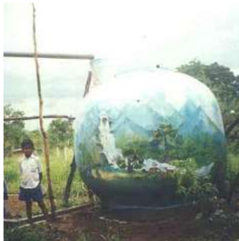
Figure 2.9 Water storage tank, Badulla, Sri Lanka