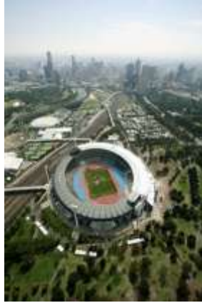
Figure 2.3 Melbourne cricket ground, Australia