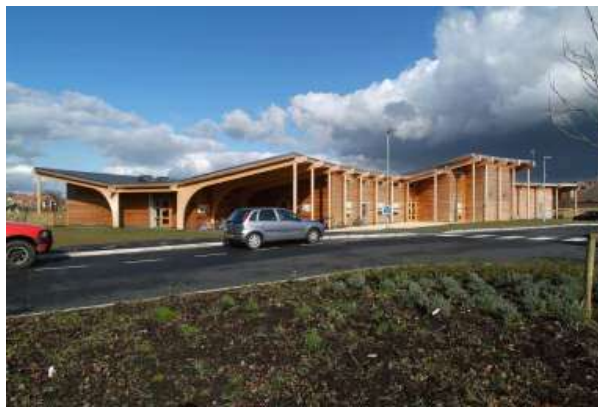
Figure 2.11 Kingsmead School, Cheshire, England

A new model primary school for Cheshire County Council, north west England (Figure 2.11). Both photovoltaic panels to provide electricity and solar heating panels to provide hot water are provided at roof level. Rainwater is collected by an underground water tank and used for toilet flushing. Renewable energy sources and conservation measures are integrated into the educational curriculum (Ove Arup, 2007).