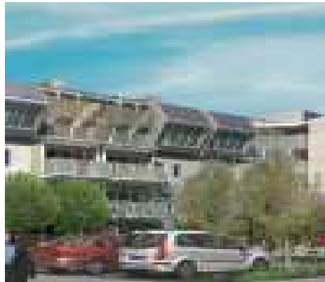
Figure 2.2 Public housing, K2, Victoria, Australia

K2 will be the first medium-density, multi-level sustainable public housing project in Victoria state (Figure 2.2). The 96 unit social housing block, a major project for the Department of Human Services (DHS)/Office of Housing (OoH), will be a model of energy conservation and sustainable building design. The key objectives of the building design by Arup, in conjunction with architects, Design Inc, were to: minimise greenhouse gas emissions; make use of reusable and recycled construction materials; minimise habitat degradation through efficient water use and pollution control. These key objectives have evolved into the design of four connected buildings ranging from four to eight storeys in height. The buildings are orientated east-west to give each unit's living room northern solar access. Rainwater collected from unit roofs will provide approximately 20% of the domestic water for non-potable use for the development each year. Grey water will be collected from sinks and basins, treated and then used for toilet flushing, (Ove Arup, 2007).