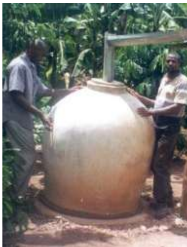
Figure 2.1 Water storage jar, Rakai, Uganda